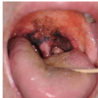
Patient No. 7: Hard Palate Melanoma

After 1 year of treatment: Complete remission, histologically proven