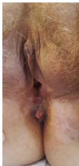
Patient No. 9: Extensive Vulvar Melanoma